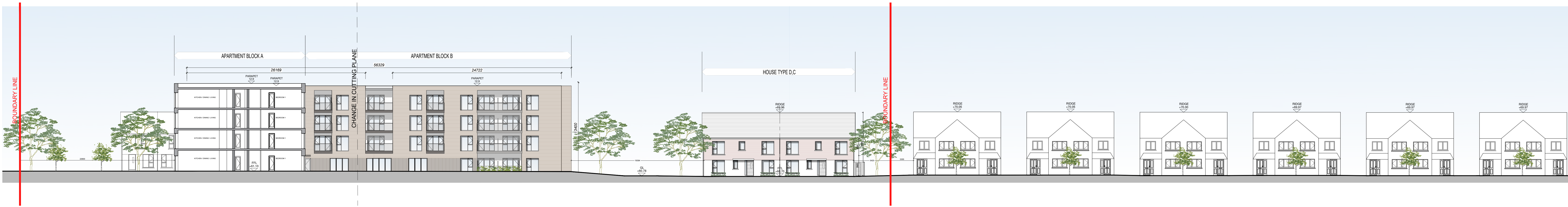
01 SECTION C - C SCALE 1:200 @ A0