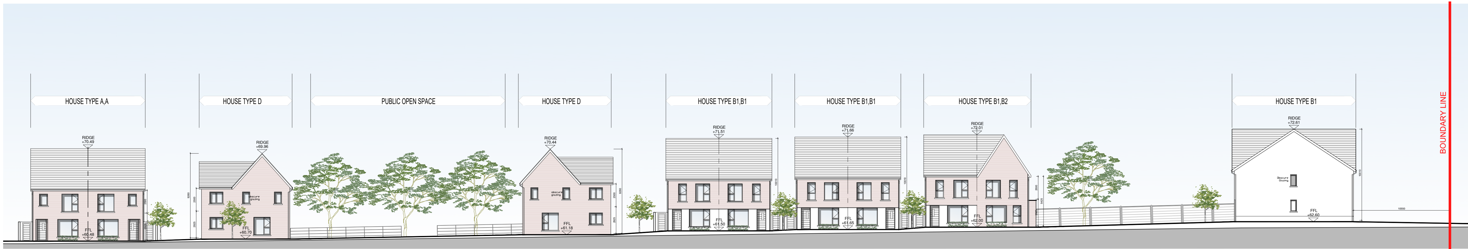
03 SECTION E - E SCALE 1:200 @ A0