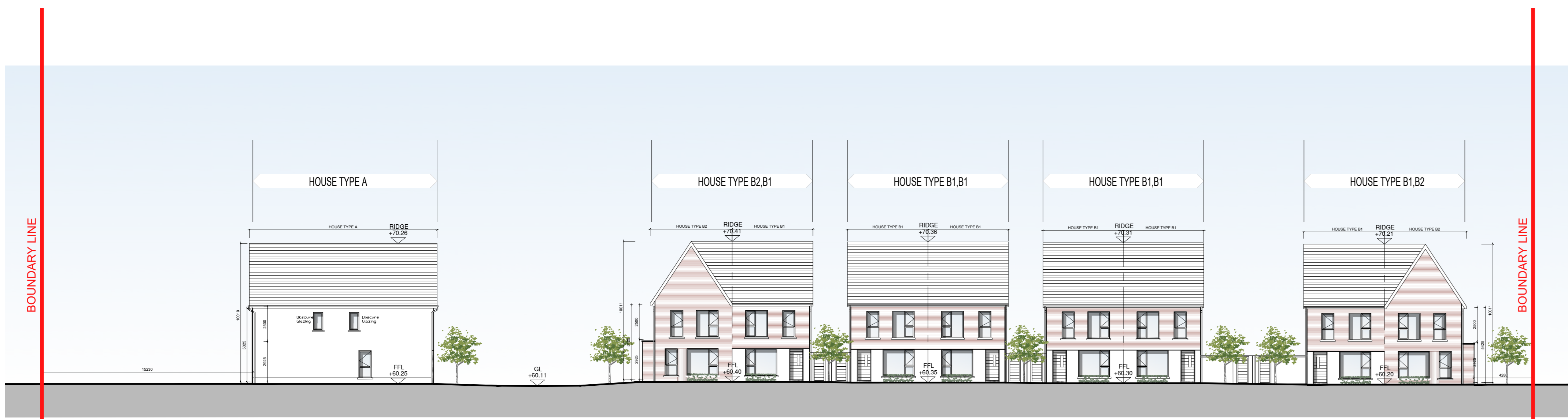
03 SECTION F - F SCALE 1:200 @ A0