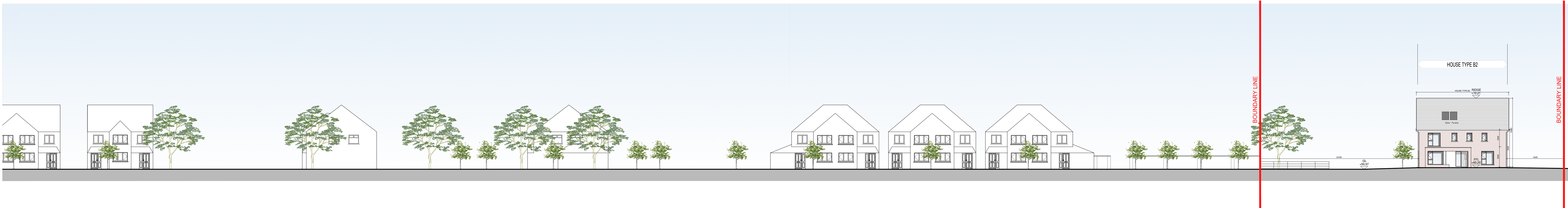
02 SECTION D - D SCALE 1:200 @ A0